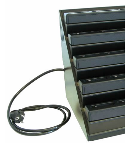
Power cable can exit on left or right side

The cabinet is equipped with a power extension block, supplying power to the power adapters of the three 10-port USB hubs. When wall mounted, the EU power mains cable and USB communication cables can exit both on the left or right side from the cabinet through the side notches.